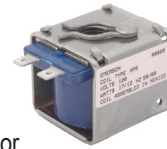
AMS - Open Frame