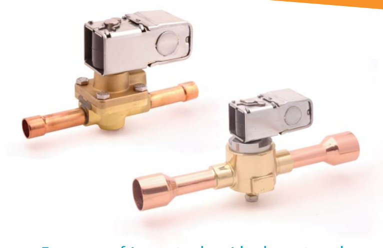
Emerson refrigerant solenoid valve external leak test results after thermal cycling

What's a solenoid valve without a replaceable coil? With Emerson's product line, all you need is one coil series for any valve size. This means less inventory on the wholesaler's shelf and in the contractor's truck.